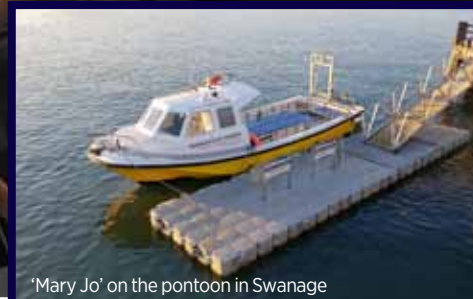
'Mary Jo' on the pontoon in Swanage