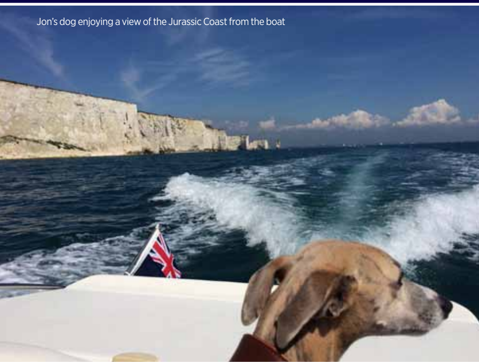
Jon’s dog enjoying a view of the Jurassic Coast from the boat

‘Liz and I love trips out with friends and family as the boat is a great way to both relax and enjoy a leisurely lunch’